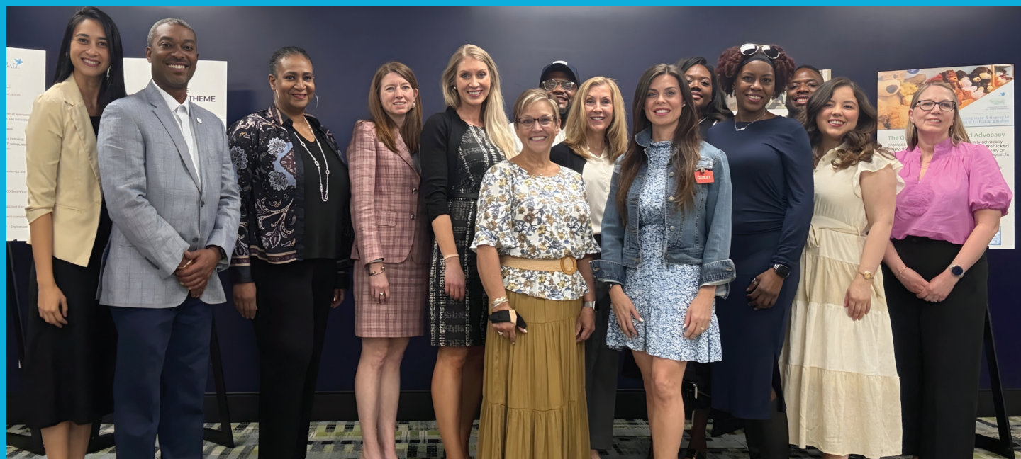
The Federal Home Loan Bank of Atlanta hosted the 30th Anniversary Cheer for Children Kick-Off.

GCCA Board Member and Senior Wealth Advisor, CPC Advisors